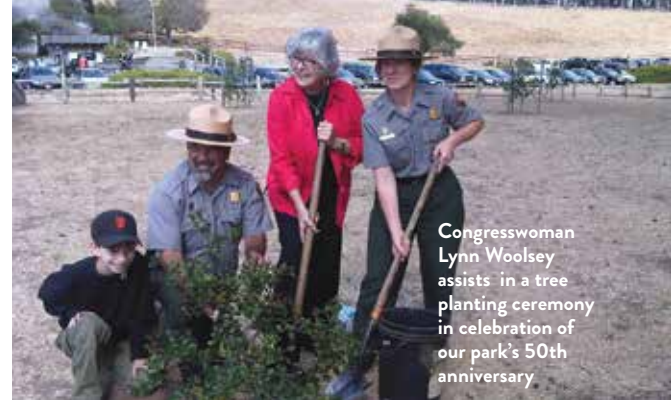
Congresswoman Lynn Woolsey assists in a tree planting ceremony in celebration of our park's 50th anniversary

This past year we celebrated the park's 50th anniversary, and honored those who had the courage, vision, and dogged persistence to create Point Reyes National Seashore.