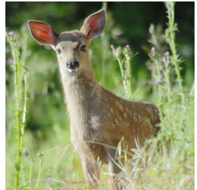
Black Tailed Deer