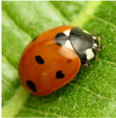
Seven-spotted Lady Bug