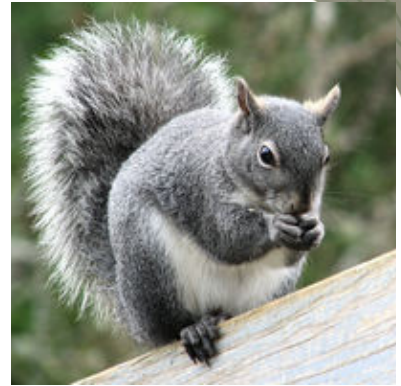
Western Grey Squirrel